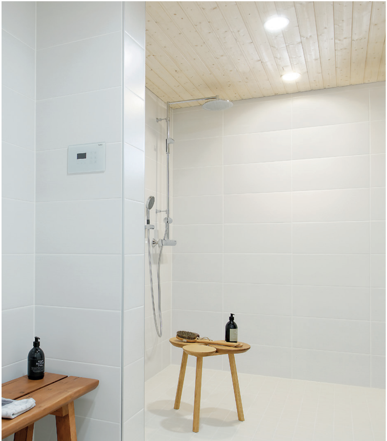
Private residence, Vantaa (Finland) | Design: Pieni talo Helsingissä - Studio Kalliomäki - & Petri Hiltula - Kontiohuute Oy | Photography: Kontio Log Houses