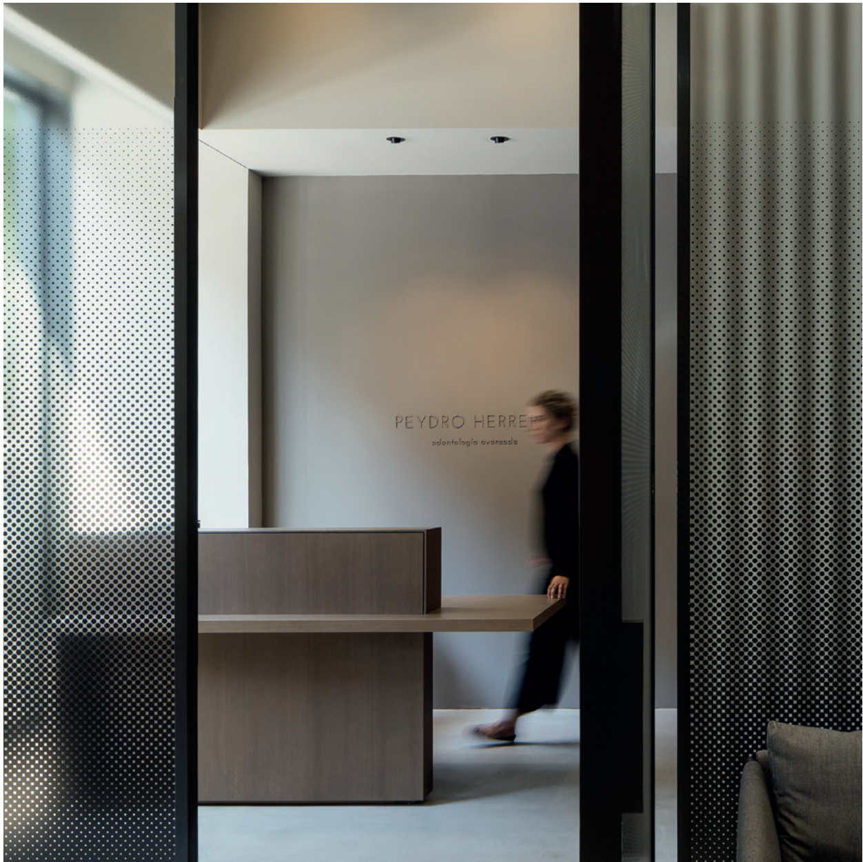
Peidro Herrero - Odontología Avanzada, Valencia (Spain) | Design: Francesc Rifé Studio

2018 WINNER EUROPEAN PRODUCT DESIGN AWARD