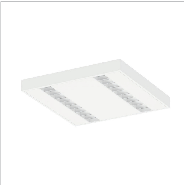
TORINO LED PAR-S 2x