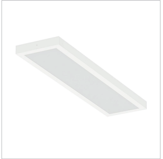
TORINO LED MPRM 300x1200