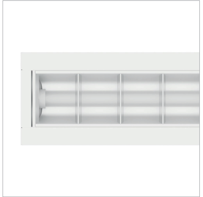
TORINO LED PAR-S 1x