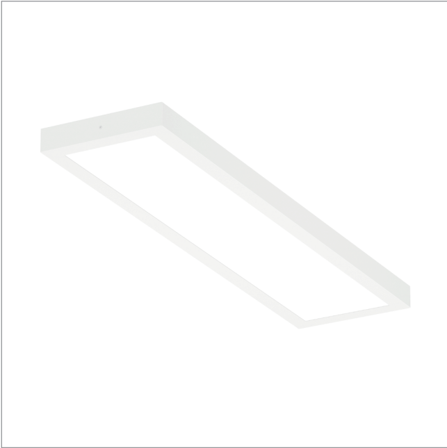
TORINO LED OPAL 300x1200