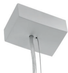
Electrical suspension Pieces in set: 1