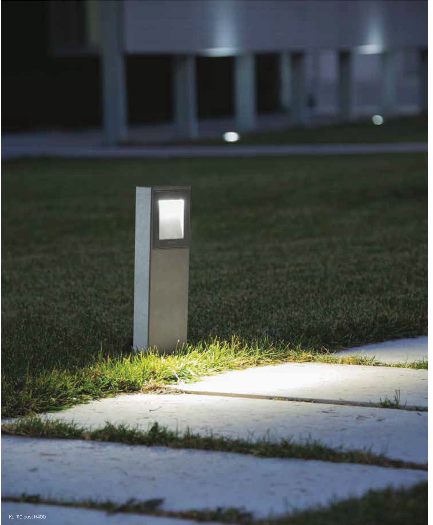
Koi 110 post H400