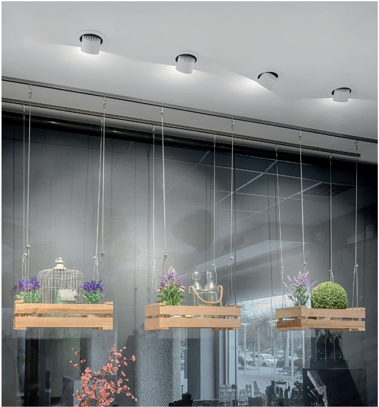
Valencia on the Rocks, Valencia (Spain)