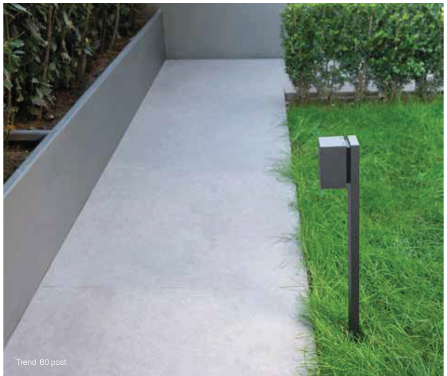
Trend 60 post